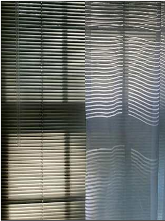
Alice Tendler Award for Artistic Innovation – Dana McKay Semblance

Judge's comment: A double take of the best kind! Is this a composite of two separate images or simply blinds and a curtain offering different takes on light and shadow? The patterns and interruption of pattern offer a wonderful play on perception and an invitation for us to study the elements of design and behavior of light, foundations of our craft.