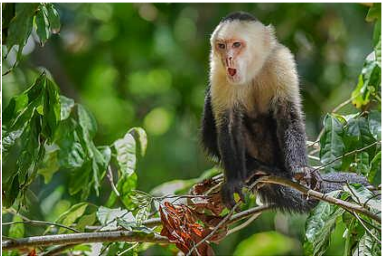
Sweet Mimic Angela Previte