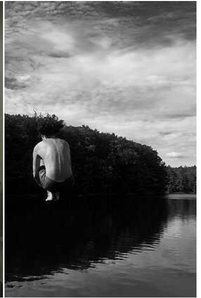
Grace O. Widener Cannonball