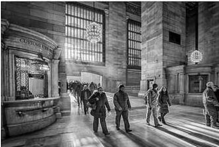
Chiaroscuro Commute: Light Play in Grand Central Peter Smejkal