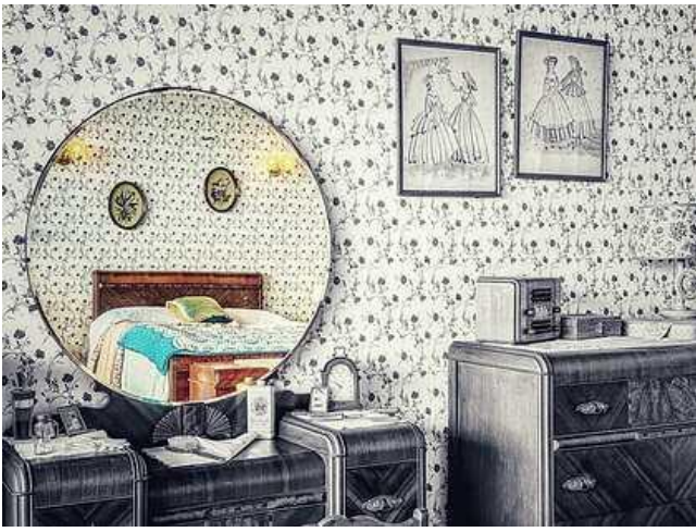
Face the Day Cheryl Bomba