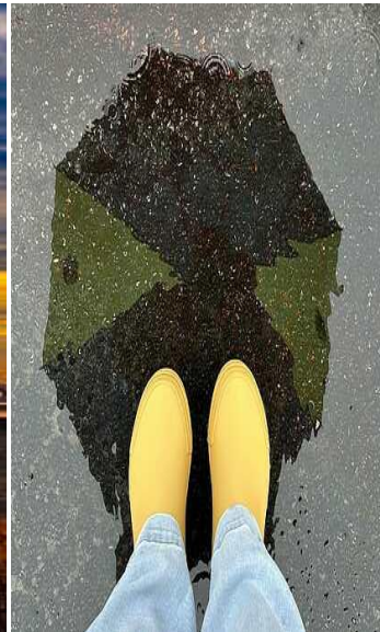
Kelly Vendetti Yellow Wellies