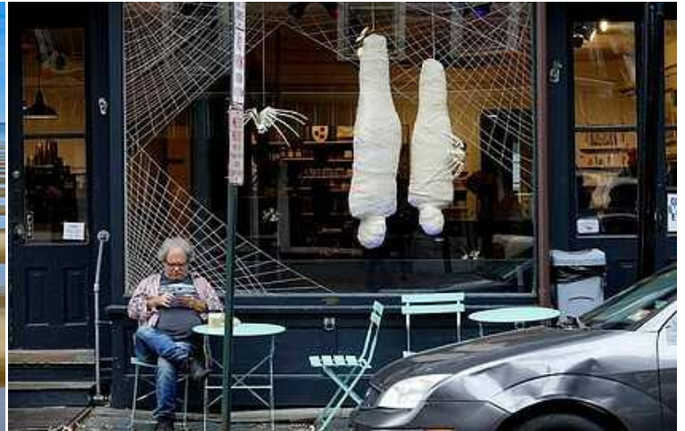
Bob Grunke Memorial Award for Street Photography (Urban) Marino Cirillo – Oblivious

Judge's comment: This is where landscape and abstract photography meet! The image is almost hypnotic in its rhythmic alternating bands of water and sand, both pleasingly smooth and clear-toned. The rhythm is punctuated by boat and person in a way that provokes the eye to move back and forth across the lines almost like a bow over violin strings. This is a song I like to hear!