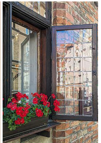
Open Window Jim Powers