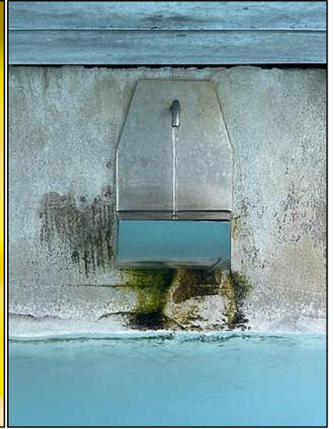
Fountain in Iceland