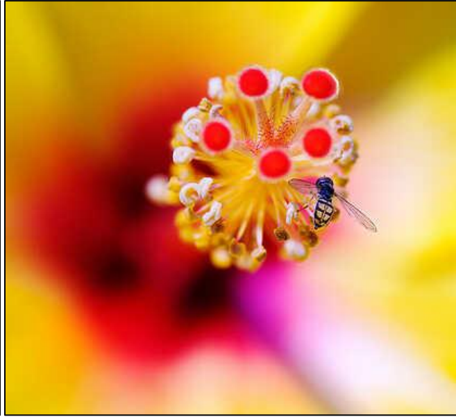
Yellow Hibiscus with Small Bee Larry Watson