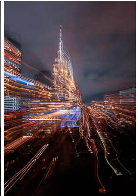
A View from Chelsea David Schlosser