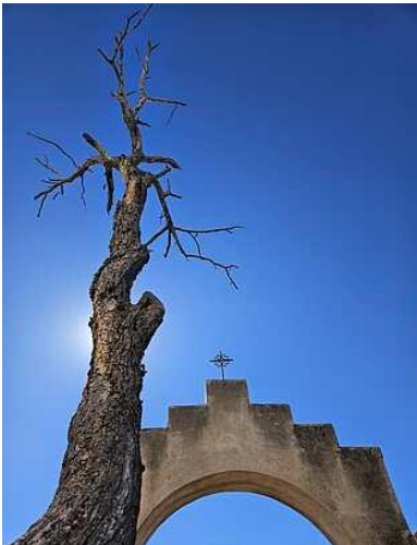
Faith in Desert Nicole Cirillo