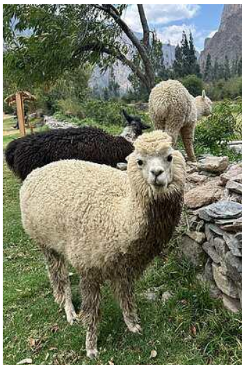
An Alpaca Welcome... Or Not... Ollantaytambo, Peru