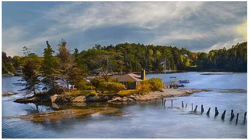
A Quiet Coastal Seascape Bearj Bahtiarian